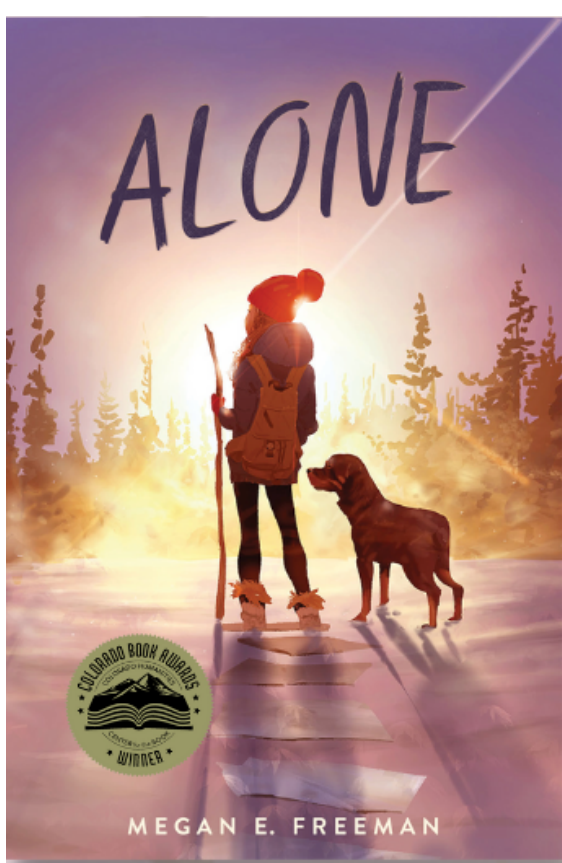
Cover art by Pascal Campion