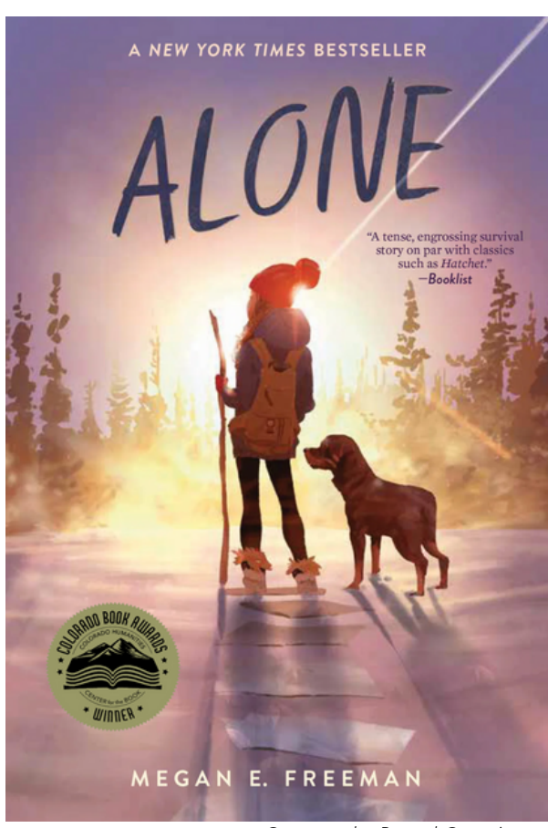
Cover art by Pascal Campion

"The novel is gripping and the plot fastpaced...This is a tense, engrossing survival story on par with classics such as Hatchet." - Booklist